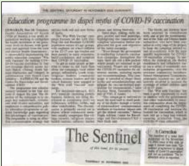
Assam Media coverage on The Sentinel