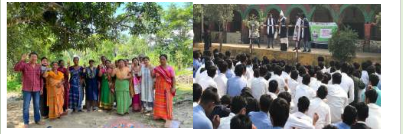
Impact and Reach of “Win with Vaccines: Project

NATHEALTH-Healthcare Federation of India, CKD built COVID-19 vaccine confidence in five low-coverage districts across Assam and Haryana. The campaign leveraged local leaders/influencers to gain inroads amongst the resistant communities. The resistant populations in the districts of Baksa, Chirang, South Salmara and Udalguri in Assam, and Nuh in Haryana, were mobilised through an intensive Behaviour Change Communication campaign.