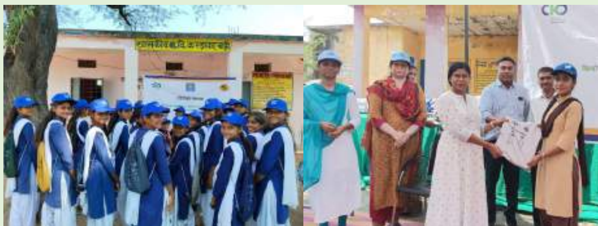
Glimpses of Adolescent girls engaging in activities during school sessions on nutrition, anemia and sickle cell anemia

Supported by GAIL (India) Limited, Project Sashakt is imparting essential knowledge on health and nutrition in tribal communities of Jhabua, Madhya Pradesh. It revolves around adolescent students, girls and boys, Self-Help Groups (SHGs) members, local governing bodies (panchayats), and healthcare providers.