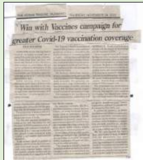
Assam Media coverage on The Assam Tribune