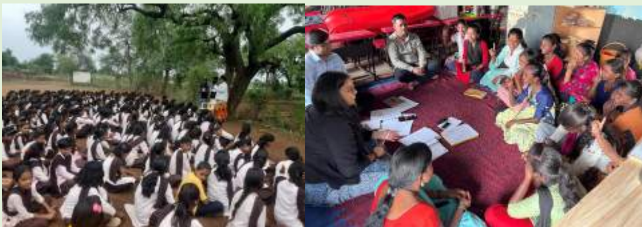
Glimpses from School Sessions on Adolescent Health and Counselling of Frontline workers on Nutrition

This is more than a program; it's a narrative of hope, where knowledge blooms and communities unite to nurture healthier futures for 6,93,916 pregnant and lactating women, young children, and adolescents.